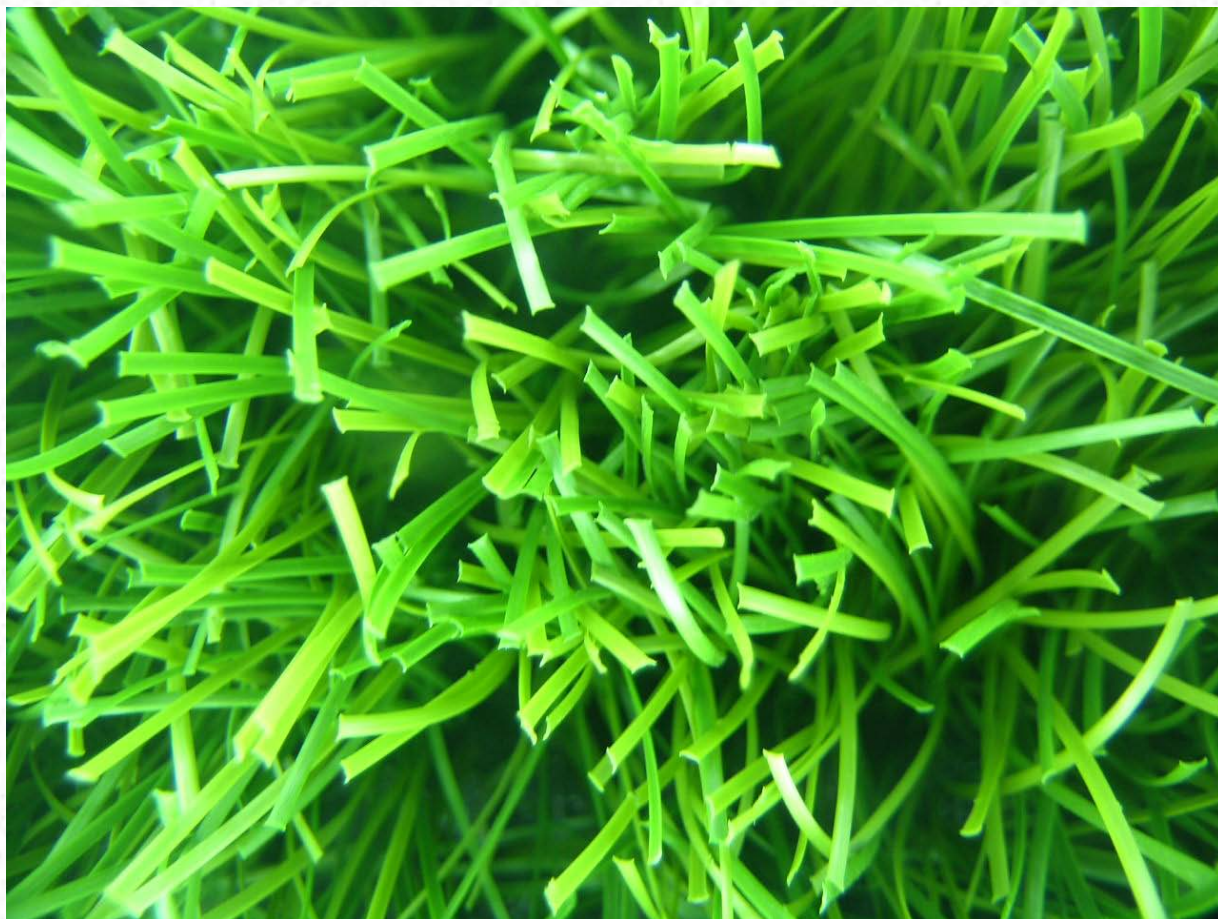
Before Lisport test

As the pictures here below can easily confirm, RADIGREEN® MFL PE ALBATROS keeps its characteristics intact after Lisport testing.