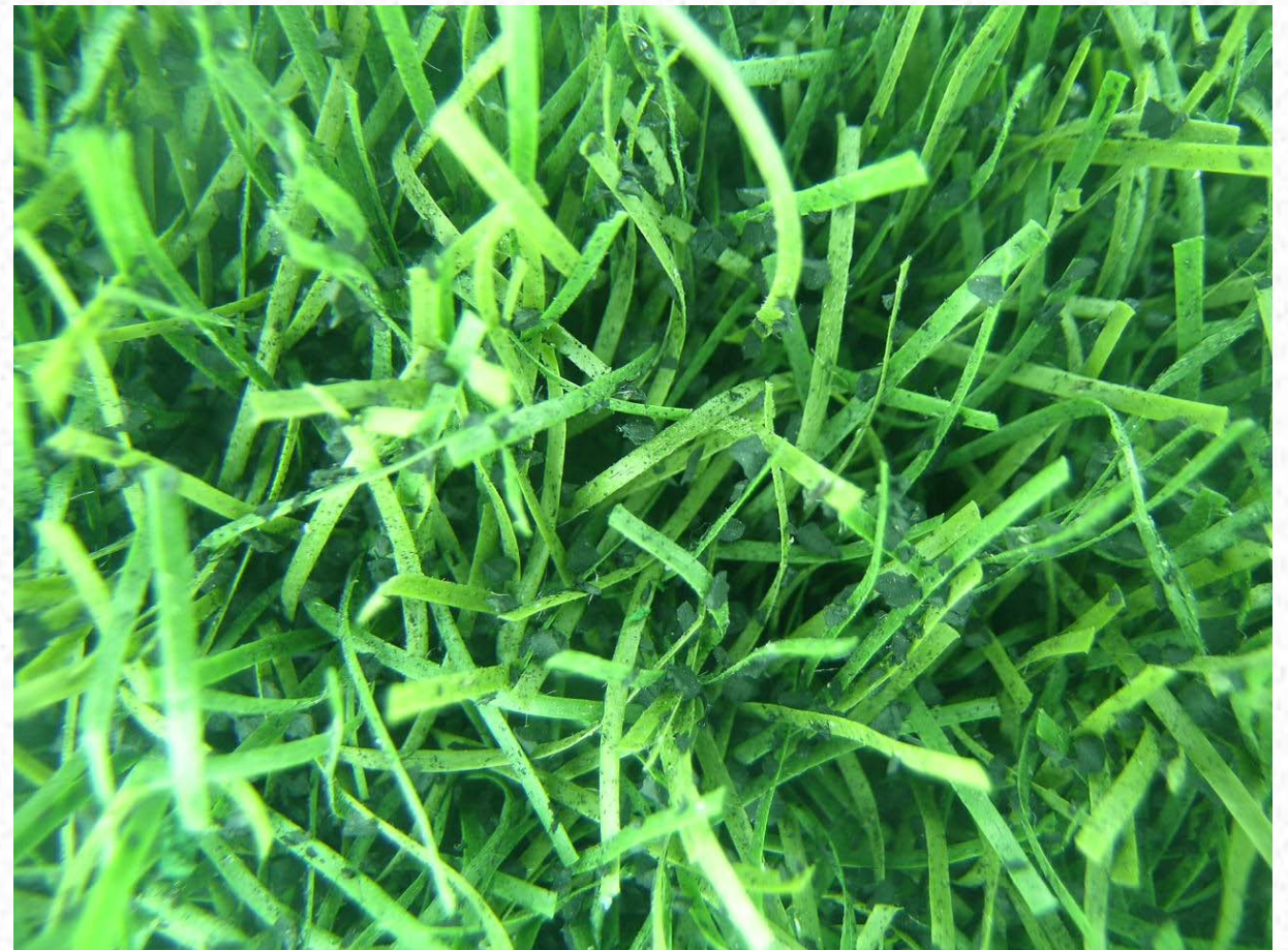
After Lisport test