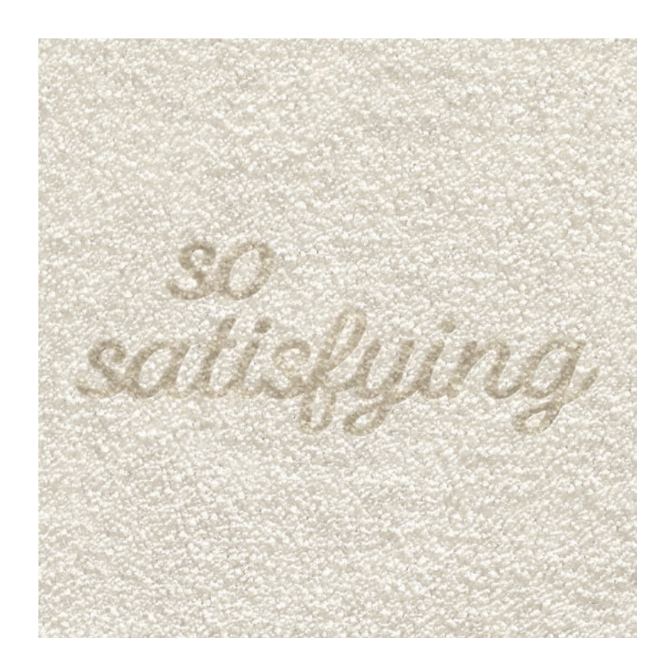
Premium quality, exclusive feelings