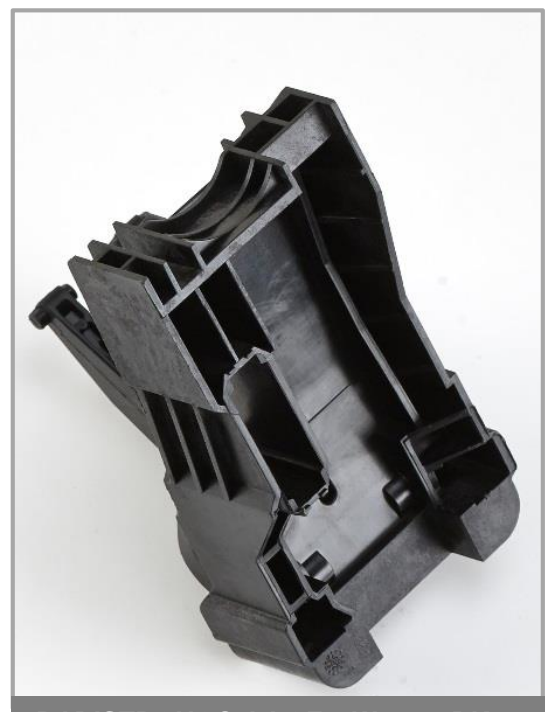
RADISTRONG® A LGF60W 3739 BK12 Brake pedal support made of PA6.6LGF60 with excellent creep resistance, superior impact and heat resistance. Application sector: AUTOMOTIVE.

These advantages can translate directly into cost reduction, shorter production and time-to-market for new products and developments, as well as more responsible use of natural resources and the