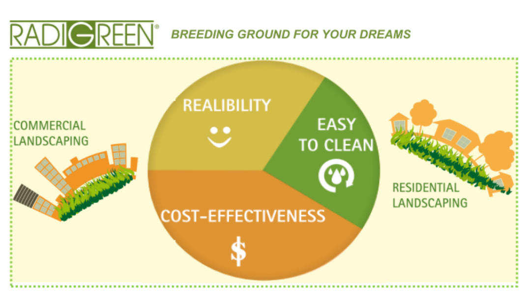
RadiciGroup at Domotex 2014

Among the MY Radigreen products available today: Straight PE monofilament + textured PP monofilament, Straight PE monofilament + textured PE monofilament, and Straight PE monofilament + textured PA monofilament.