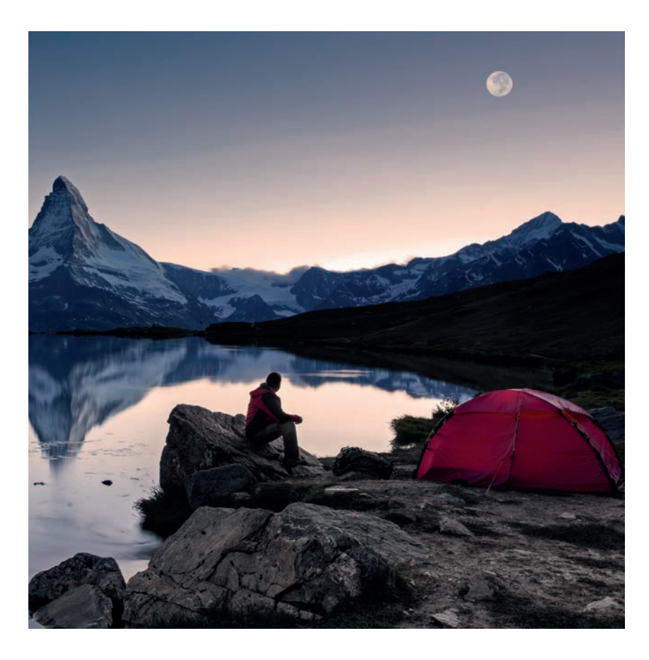
Recycling at the highest level